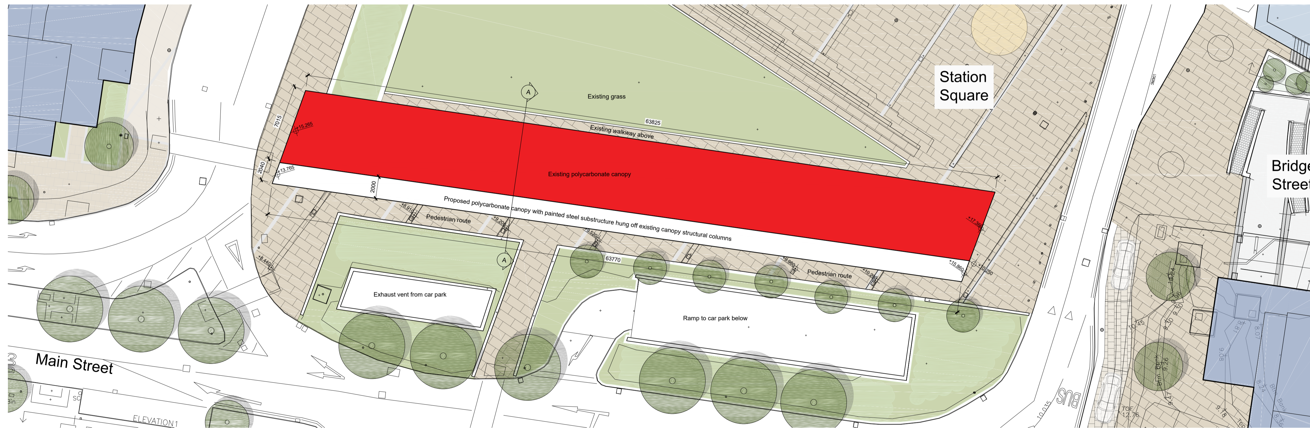
PROPOSED ROOF PLAN OF BIKE PARKING AND CANOPY